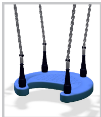
Option: Toddler Seat