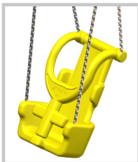
Option: ADA Seat