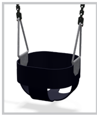
Option: Infant Seat